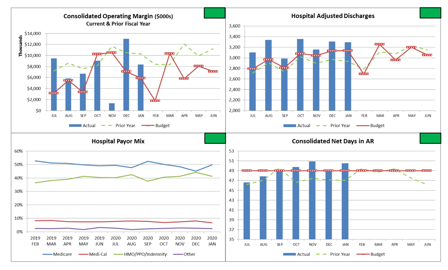
El Camino Health