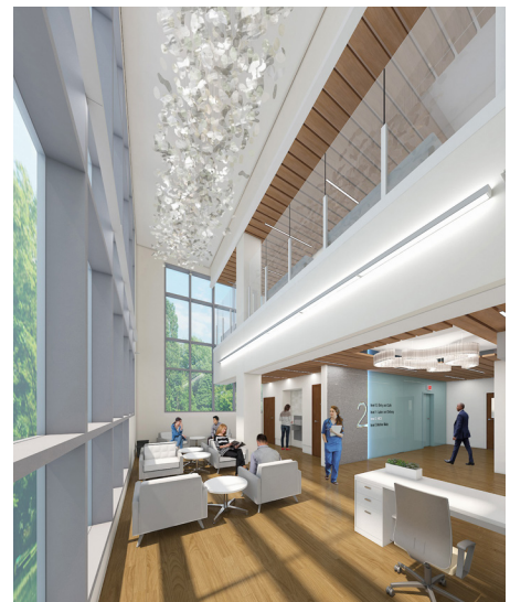
Rendering of the 2nd and 3rd floor lobby