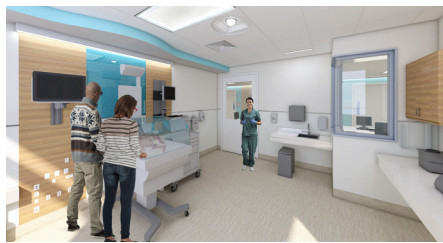
Rendering of a private NICU room