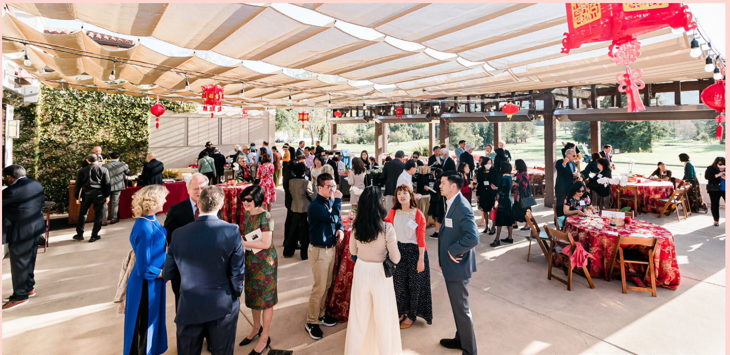
Guests mingled and dined in the courtyard overlooking the 18th hole.