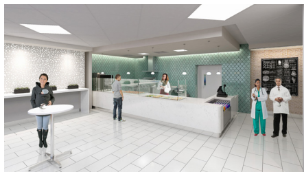
Rendering of the ground floor café