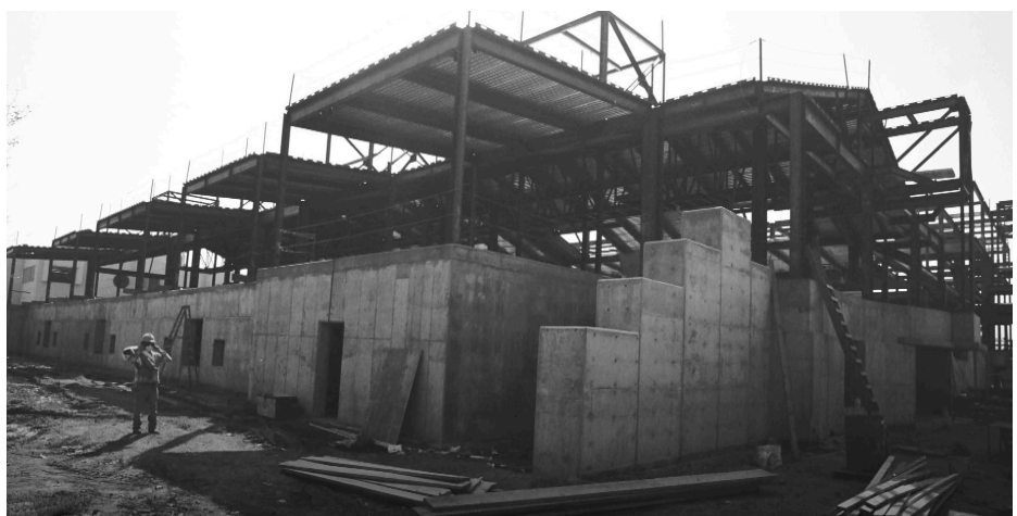
Construction of the original building in the early 1990s