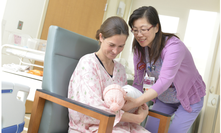
The El Camino Fund will support scholarships for El Camino Health nurses who wish to pursue advanced studies for a Master's of Science in Nursing or a Doctorate of Nursing Practice degree.