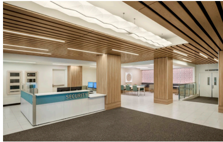
New maternity rooms offer light-filled, private spaces designed for families. Renovated Labor & Delivery suites provide greater comfort and clinical safety.

parents to play an active role in healing and bonding from the very first moments of life.