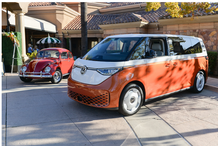
The Official California Dreamin' Fleet Cars