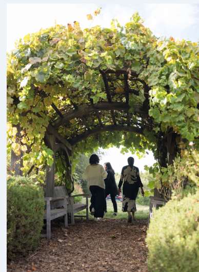
Hope to Health members enjoying A Feast for the Senses