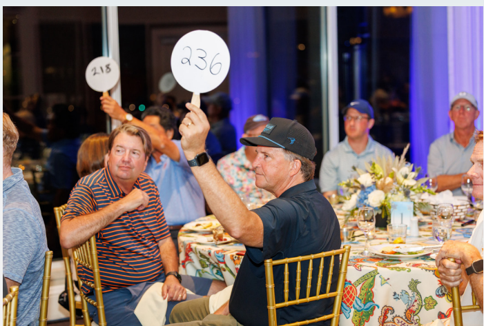
Generous donors raised their paddles to support Cancer Care in Los Gatos