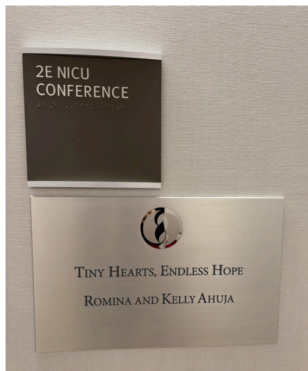
Plaque engraving: "Tiny Hearts, Endless Hope"