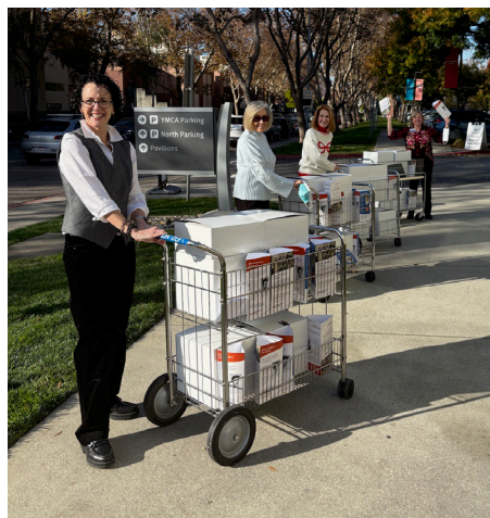
Volunteers and Foundation staff distribute thousands of cookies in Mountain View and Los Gatos