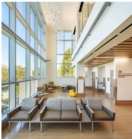
The new entry and waiting areas welcome families with light and natural elements.

These improvements represent more than added space—they reflect a deeper commitment to women's and families' health and well-being. With private rooms for every mother and infant, we're reducing infection risk, enhancing emotional safety, and ensuring that every patient receives the highest standard of care in a setting that honors her experience. The Orchard Pavilion expansion will serve more than 5,000 births each year, offering an environment that nurtures not only healthy outcomes but also hope, connection, and confidence for new parents. This project reaffirms El Camino Health's enduring belief: that when women and families thrive, the whole community grows stronger.