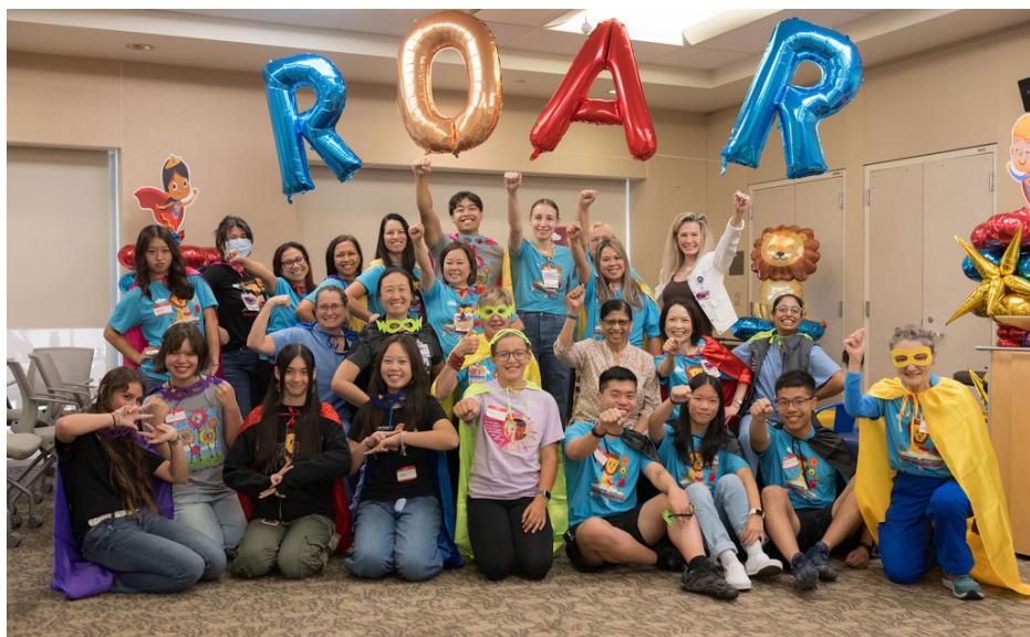
NICU Nurses and Alums

This year's celebration drew nearly 200 attendees, with dozens of NICU graduates and their families returning to reconnect with the doctors, nurses, and volunteers who guided them through those tender first weeks.