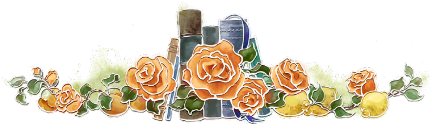
Illustration by Lindsey Melchor