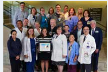
The El Camino Hospital Stroke Team

Every minute counts for stroke patients, so access to expert care minutes from home is critical. El Camino Hospital is a Joint Commission certified Primary Stroke Center and the dedicated stroke team follows the most rigorous, best practice rapid triage and response protocols. They are able to provide diagnosis and treatment within just 15 minutes of every stroke patient's arrival by ambulance to the emergency department. For the last 11 years, the hospital has also been recognized by the American Heart Association and American Stroke Association as a Gold Plus award winner for meeting all Get with The Guidelines® Stroke Performance Achievement indicators,