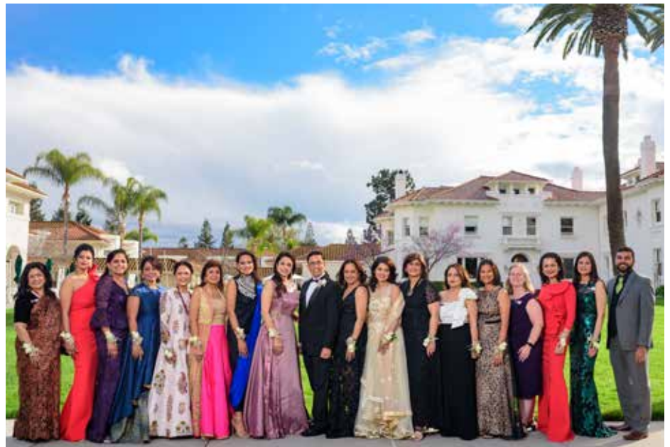
The 2018 Scarlet Ball committee

The South Asian Heart Center launched in 2006 with the mission of reducing the high incidence of heart disease and diabetes among people who trace their origin to India, Pakistan, Nepal, Bangladesh and Sri Lanka. Its groundbreaking science-based, lifestyle-focused and culturally sensitive approach to risk reduction and management delivered